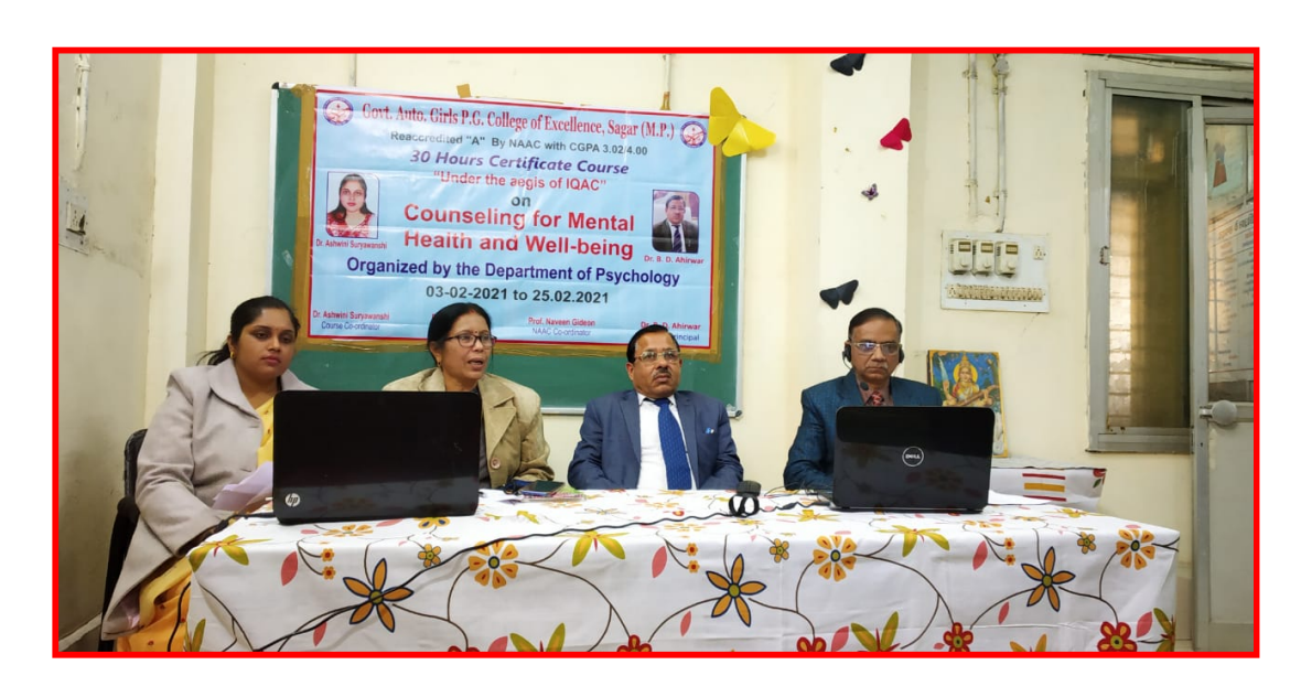
Certificate Course : Psychology Department