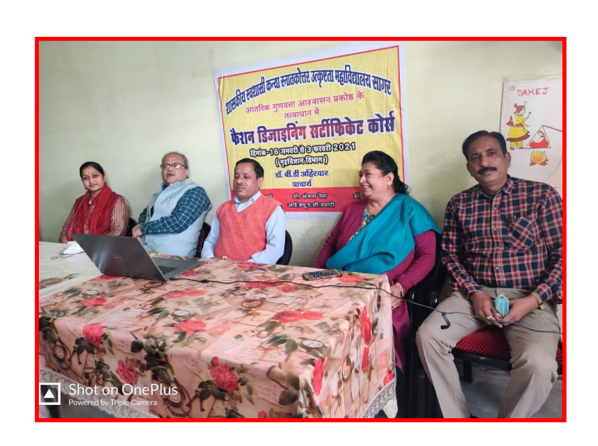
Certificate Course : Fashion Design