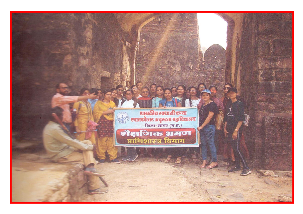
Education Tour Zoology Department