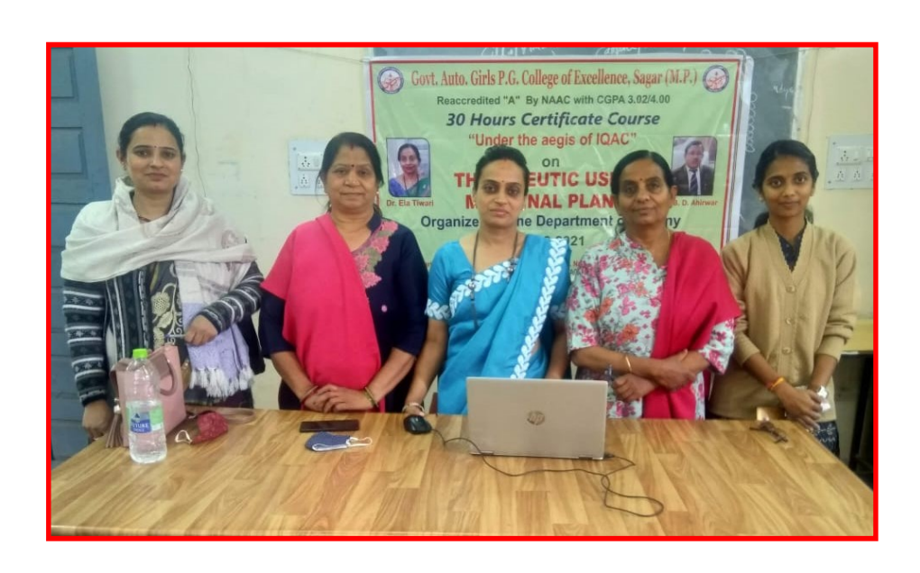
Certificate Course Therapeutic Aspects of Medicinal Plants Botany Department