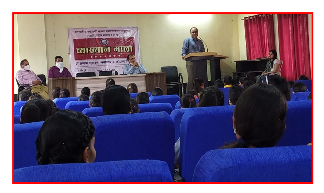
Special Lecture Commerce Department