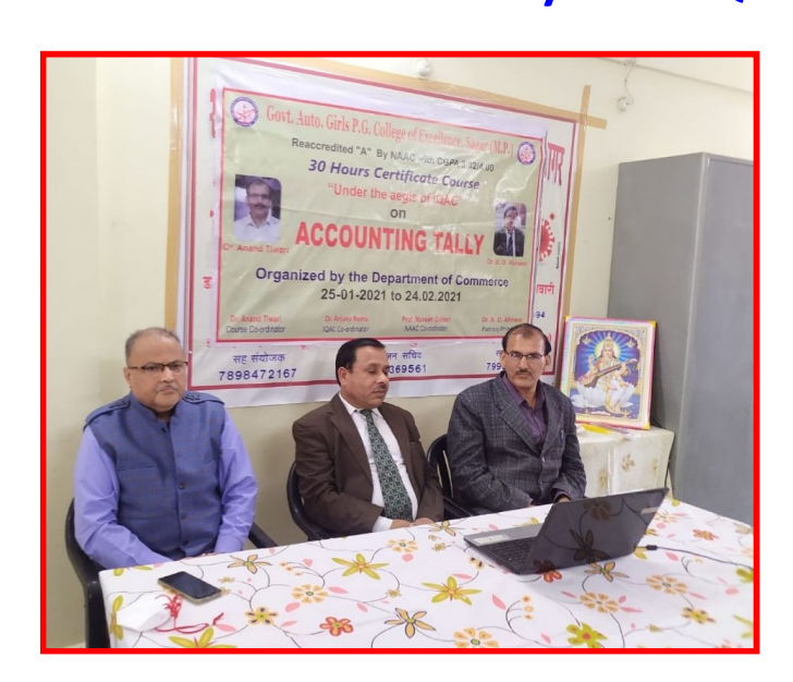
Certificate Course Tally Commerce Department