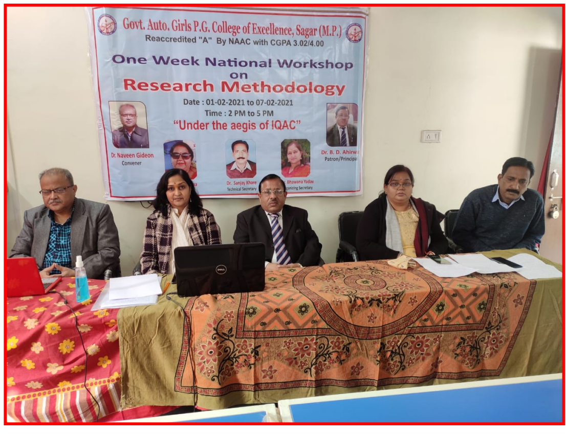
Workshop Research Methodology