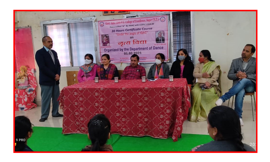
Certificate Course: Dance