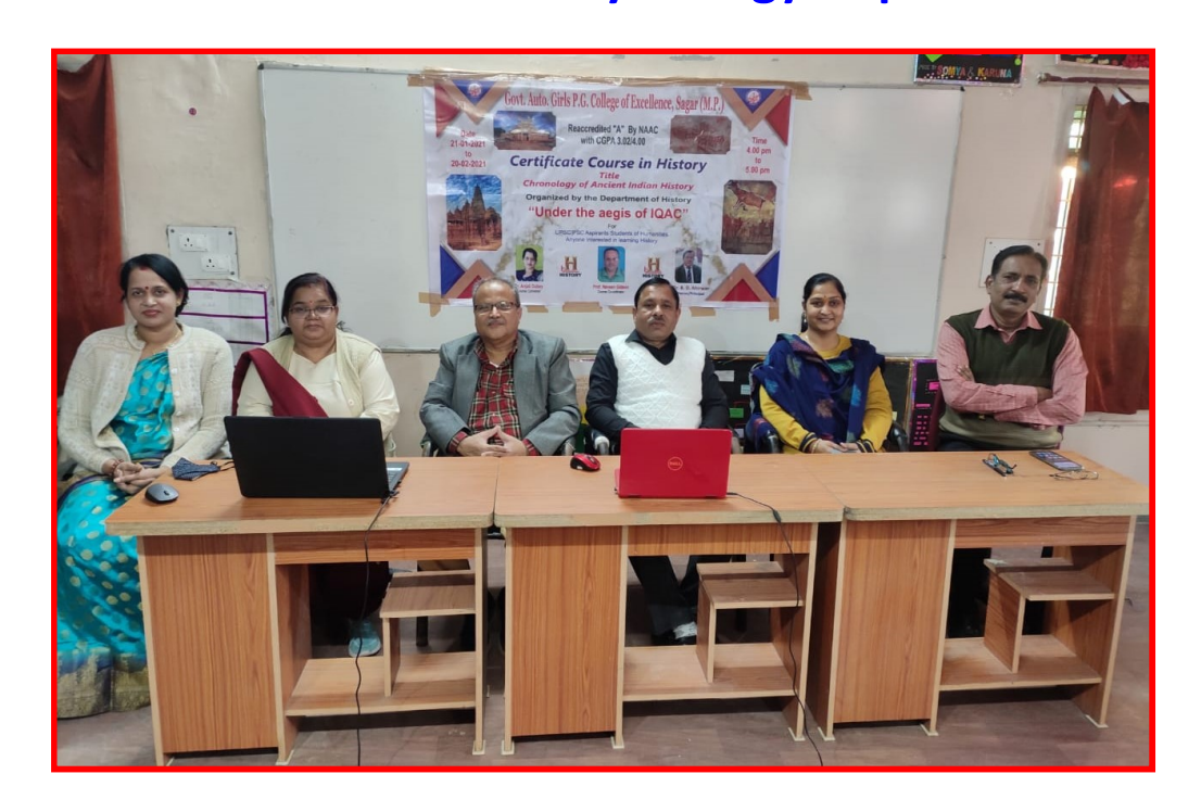
Certificate Course: History Department