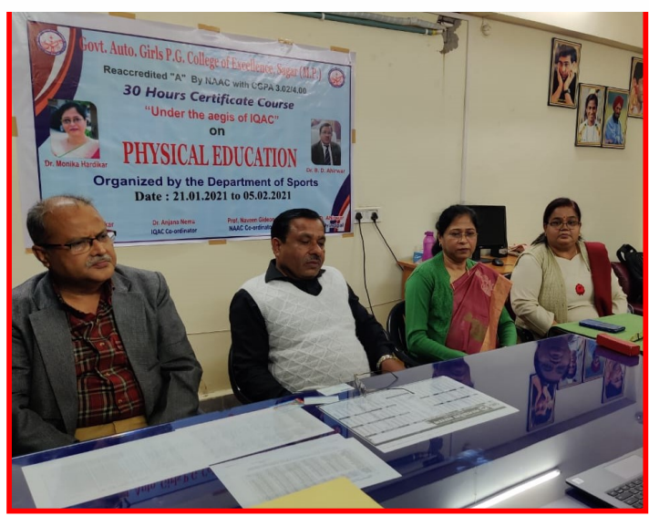
Certificate Course Physical Education Department