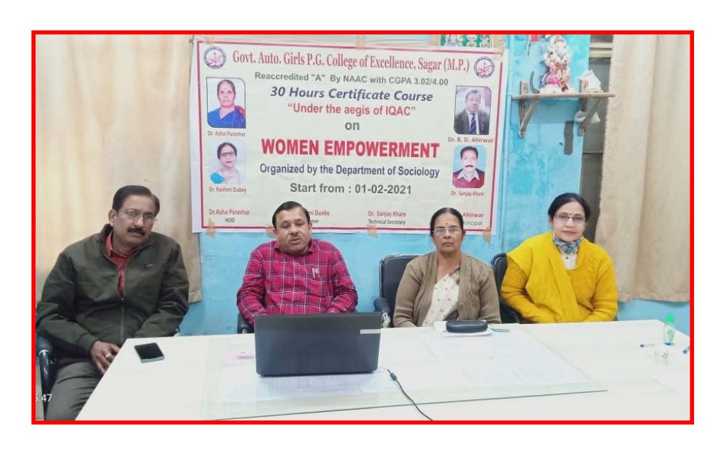
Certificate Course: Women Empowerment